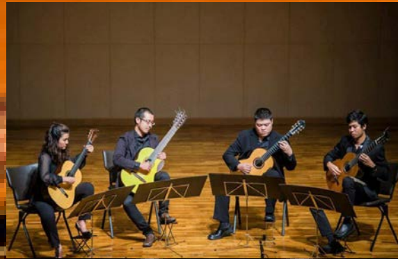
Wong-Kojorn Guitar Quartet